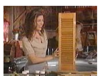
Touch up bare spots as needed