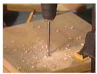
Drill a hole in the base the size of the peep hole

The lazy Susan used on this project is first attached to the base, which is stationary. Cut the base square large enough to balance the shutters or at least two inches larger than the width of the shutters. Cut another piece of wood square and an inch smaller in each direction than the base.