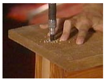
Attach the smaller base to the shutters