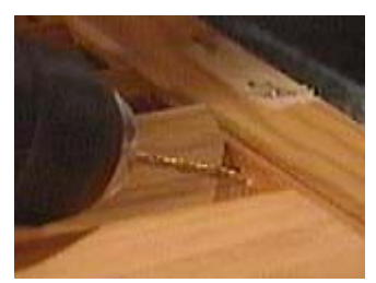
Pre-drill for the screws