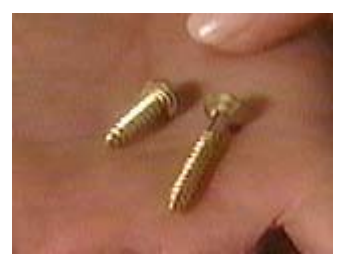
Pan head and counter-sink brass screws

So the remedy for this situation is to choose a drill bit about the size of the head that's stripped. Drill enough of the head off (brass is soft so this happens pretty easily) to allow the hinge to be pulled off over the drilled screw. Don't drill away any more of the screw than you absolutely have to because once the hinge is off, the screw will have to be removed by backing it out with a pair of needle nose pliers.